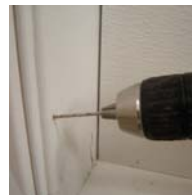
Drill pilot holes.