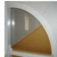
Try shade to insure fingers are properly engaged in shade carrier.