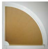
Demonstrate proper operation to customer