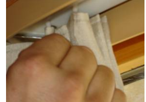
Insert connectors into track.