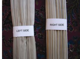
Identify right side shade. Leave bands on.