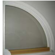
Position shade on sill.