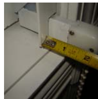
Measure edge to track.