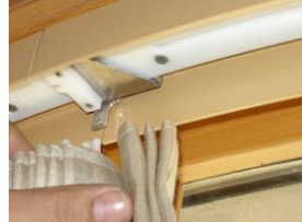
Locate insertion point.