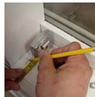
Add 1 1/4” and scribe line.