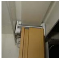
Engage fingers in shade carrier.