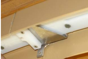
Bring car to top of arch.