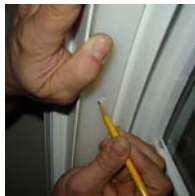
Mark hole centers.