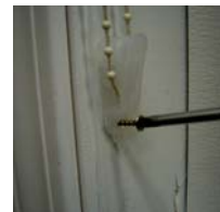
Screw in place.