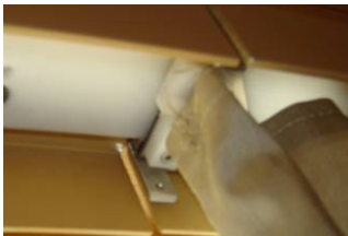
Insert last connector into plastic receiver.