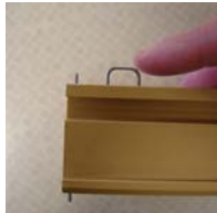
Locate left hand shade.