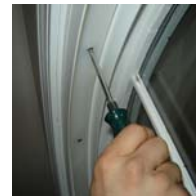
Screw track to frame.