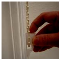
Locate tension bracket.