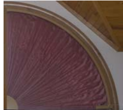
After carefully lowering shade and straightening pleats, raise and lower shade.