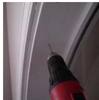
Drill pilot holes.